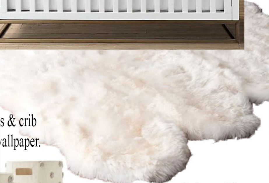
Super soft sheepskin rug layers over carpet to add texture and comfort.