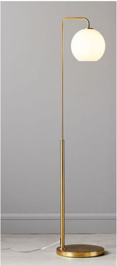
Floor lamp w/ dimmer will let you control the light during late night feedings.

Visually interesting accent wall behind crib in subtle, yet impactful design.