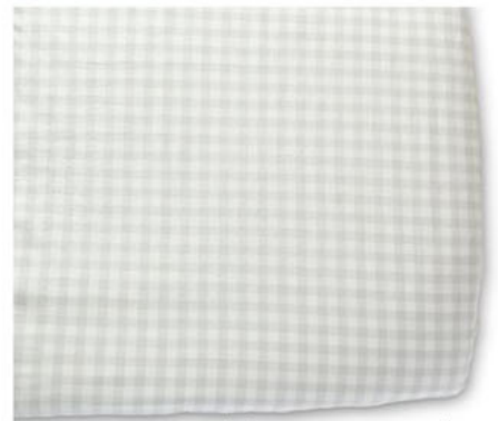
Fun storage baskets & crib sheet compliment wallpaper.